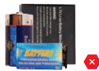
NO Batteries Check local drop-off programs for proper disposal