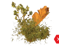
NO Green Waste