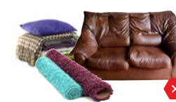
NO Clothing, Furniture & Carpet