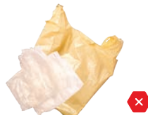
NO Loose Plastic Bags, Bagged Recyclables or Film Empty recyclables directly into your bin.