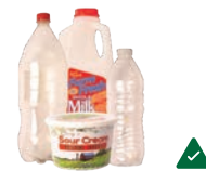
Plastic Bottles, Jugs, & Tubs